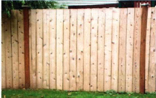
ESTATE STYLE WITH POST CAPS

Homeowners planning a new or replacement fence must submit a Homeowner Request for Project Approval to the Brighton Homeowner’s Board. The following fence styles have been pre-approved by the board. Homeowners who will use one of the pre-approved fence styles must indicate on their request which fence style they plan to use. If the desired style is not shown here, the homeowner must include on their request a detail or picture of the proposed