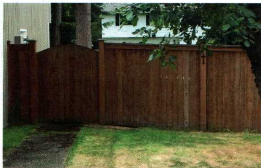
MODIFIED PANEL B With 2x4 top cap, and arch top gate

design they wish to use. For all new fences, the Request must include a site plan showing the fence location in addition to the proposed fence style. Note: new fences also require a City of Mill Creek permit prior to construction-call 425 921-7502 for information.