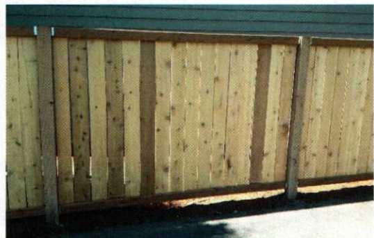
MODIFIED PANEL A With 1x4 horizontal trim top and bottom